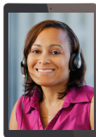
Access to expert coaches for advice on diet, lifestyle and more