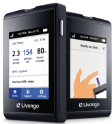
A smart blood glucose meter to guide your journey